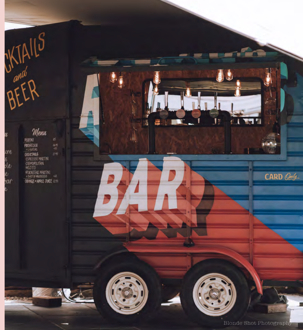
Blonde Shot Photography