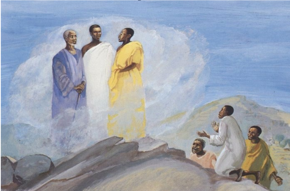
Transfiguration JESUS MAFA, 1973

*for those who wish to stand Bold print indicates congregational participation