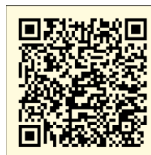
QR Code for Financial Support

As we move forward in the planning and preparation phases of the Panama Mission Trip , please pray for: