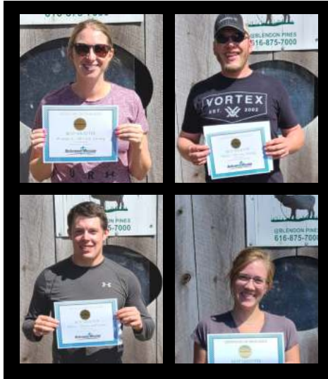
Congratulations to our top scoring winners!

It was good to see familiar faces that we haven't seen in awhile and catch up with brothers and sisters in the Lord who support RMS's work and their service to the Kingdom. The refreshingly cool morning and occasional misty rain early on did nothing to dampen the spirits of all who gathered.