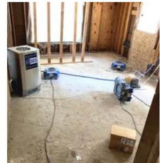
Through cooperation with the OPC Disaster Response team, we have been working to restore a Midland family to their home.